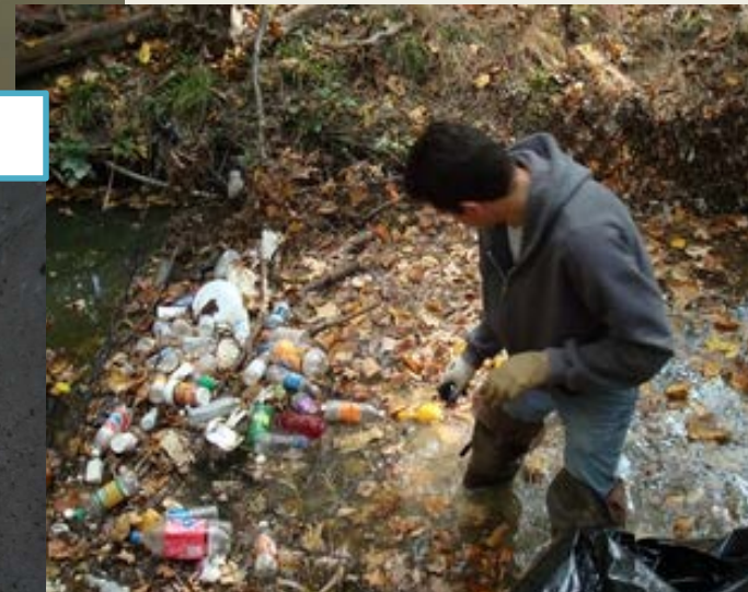
Creek Clean Ups