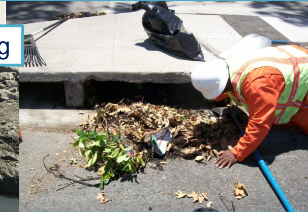
Clean Water Features