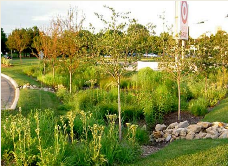
Stormwater Retention and Infiltration