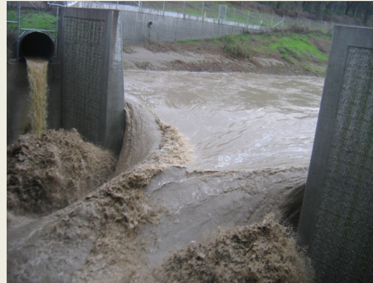
Regional Flood Protection